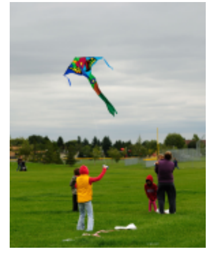
Photograph from our 20th Kites Over Callingwood event